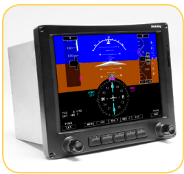
Primary Flight Display Systems