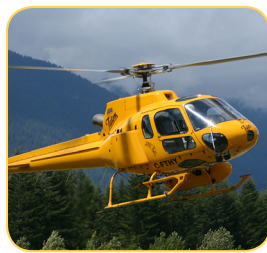
Flight Test Instrumentation

This standalone AHRS solution is designed for avionics retrofit and OEM aircraft applications. The AHRS500GA is available in several different configurations that provide the flexibility to accommodate various system interfaces, and typical mounting orientation and installation location requirements.