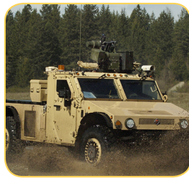
Platform Stabilization Unmanned Vehicle Control

The VG440 combines highly-reliable MEMS gyros and accelerometers with high-speed DSP electronics to provide a fully stabilized vertical gyroscope in a small and rugged environmentally-sealed enclosure. The VG440 provides consistent performance in challenging operating environments and is user-configurable for a wide variety of applications